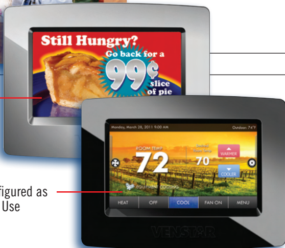
Advertise for business