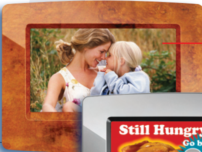
Digital picture frame operation